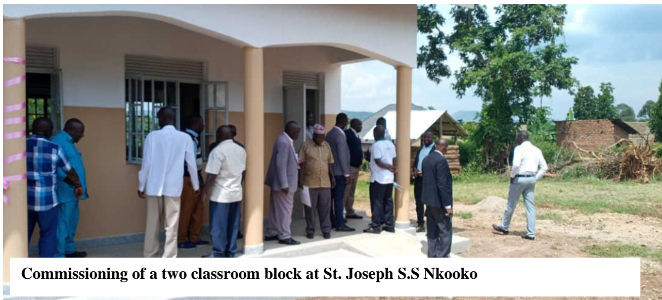
Commissioning of a two classroom block at St. Joseph S.S Nkooko