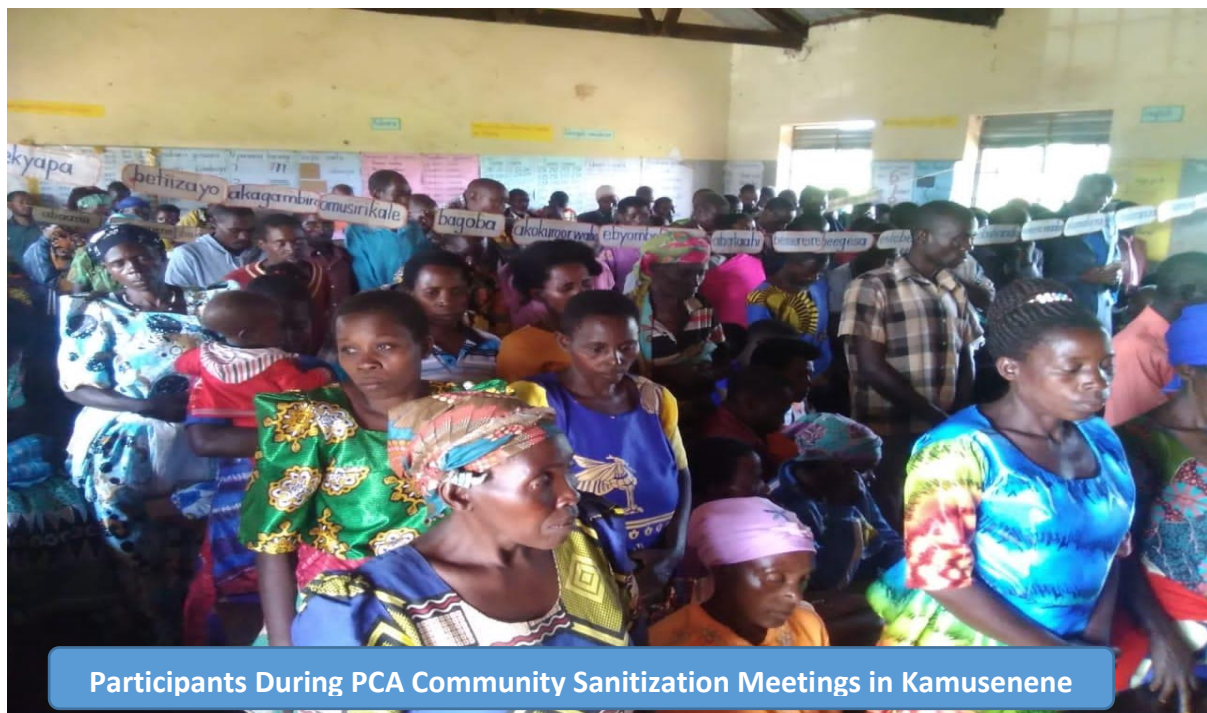
Participants During PCA Community Sanitization Meetings in Kamusenene