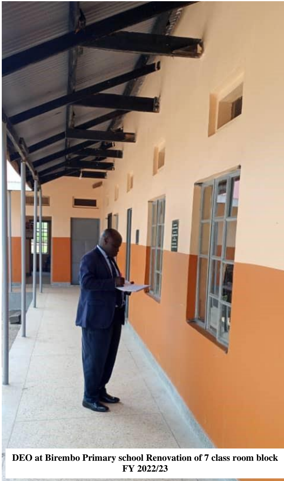
DEO at Birembo Primary school Renovation of 7 class room block FY 2022/23