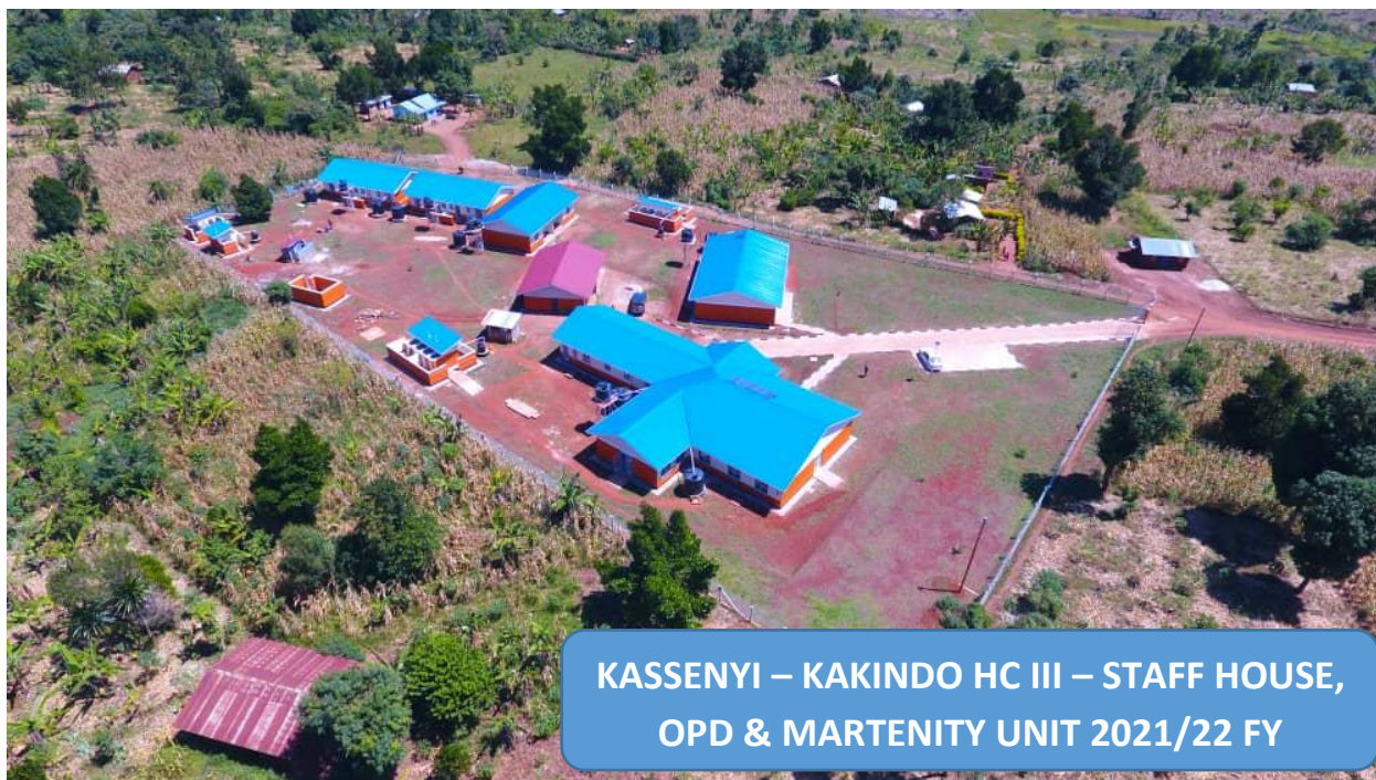
KASSENJI – KAKINDO HC III – STAFF HOUSE, OPD & MARTENITY UNIT 2021/22 FY