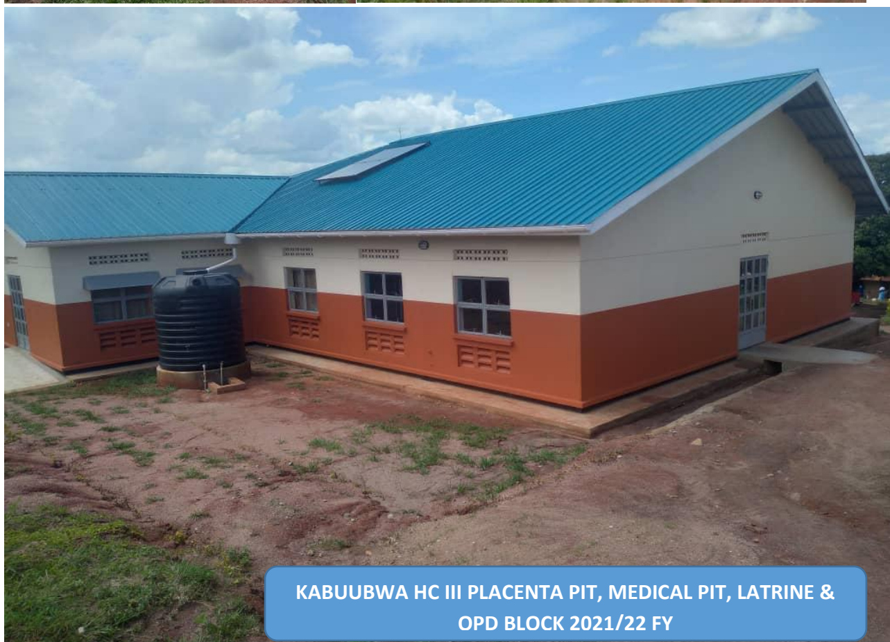
KABUUBWA HC III PLACENTA PIT, MEDICAL PIT, LATRINE & OPD BLOCK 2021/22 FY