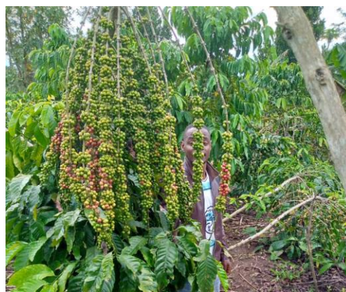
4 acre modal farm at Kikwaya coffee demonstration on proper use of fertilizer