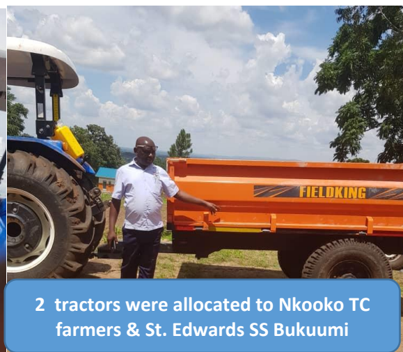
2 tractors were allocated to Nkooko TC farmers & St. Edwards SS Bukuumi