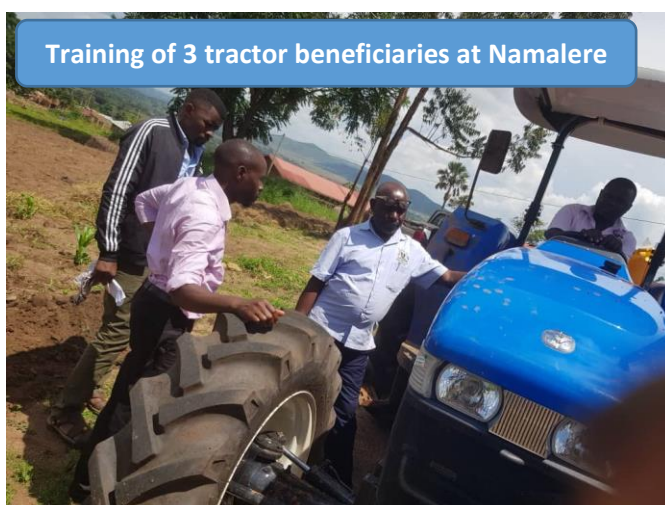
Training of 3 tractor beneficiaries at Namalere