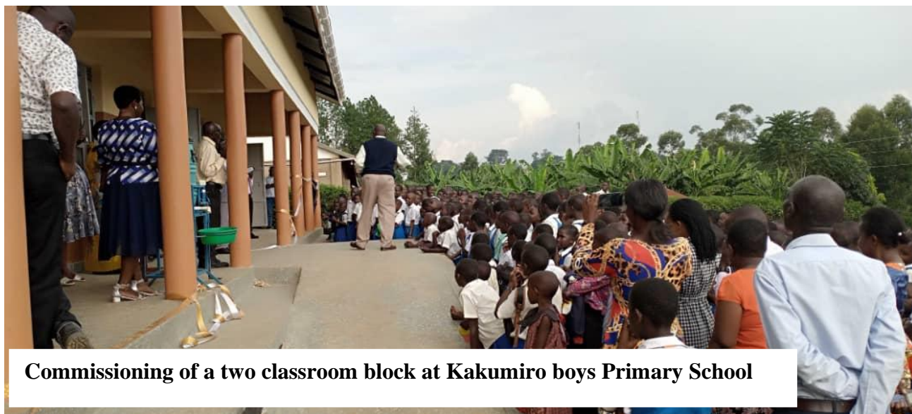
Commissioning of a two classroom block at Kakumiro boys Primary School