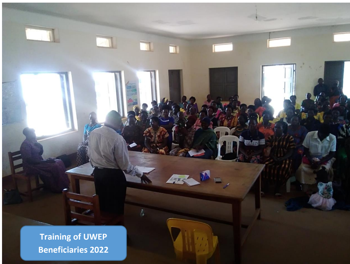
Training of UWEP Beneficiaries 2022